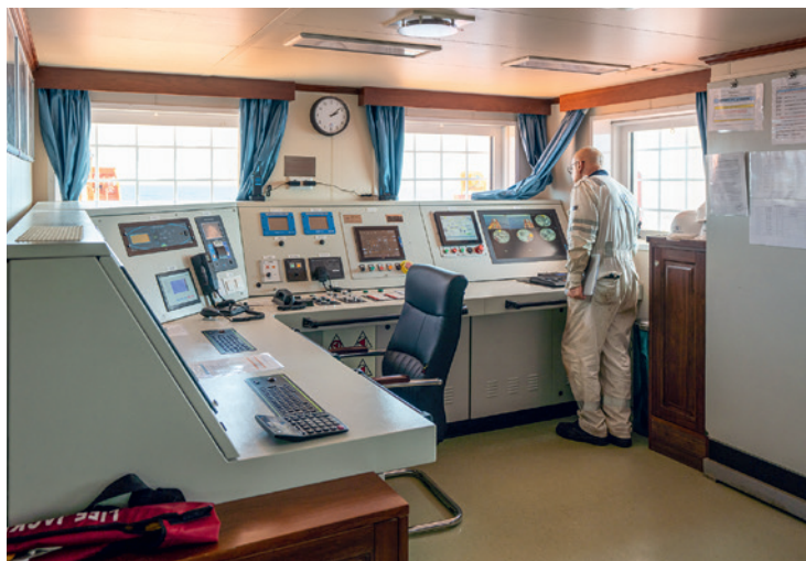
The cargo control room (CCR) offers ample workspace