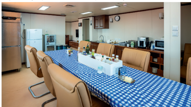
Messroom with typical box of assorted spices for the real taste