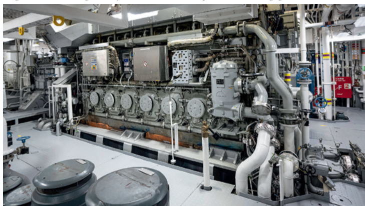
Engine room with main engine, also with plenty of working space