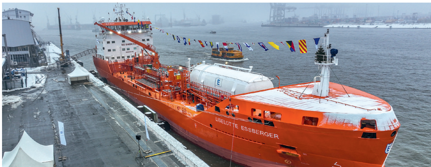
All prepared for the naming ceremony. It was a cold and grey winter morning when the "Liselotte Essberger" was awaiting the guests at the Cruise Terminal Altona