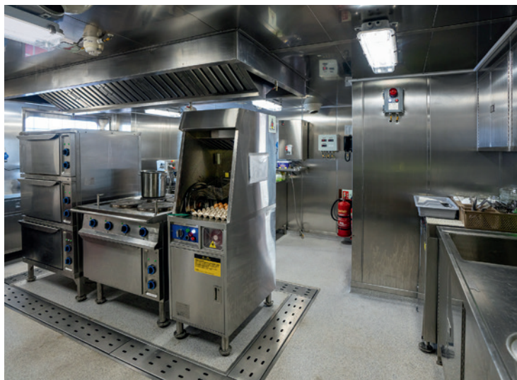
Professional galley in stainless steel, ready to serve a gourmet restaurant