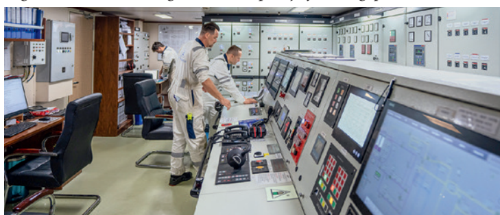
Engine control room (ECR) – the empire of the chief engineer and his hands